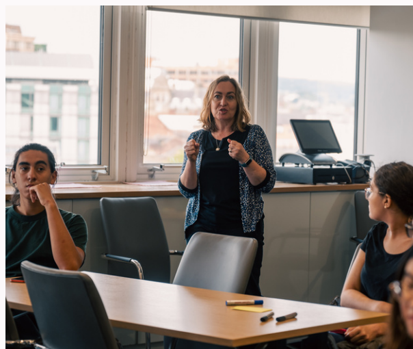
Food and Nutrition GIAG 2023