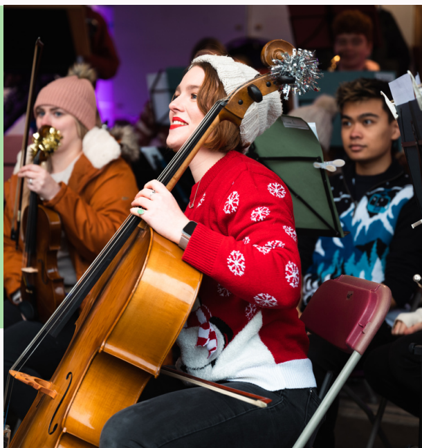
Band Christmas Concert 2022